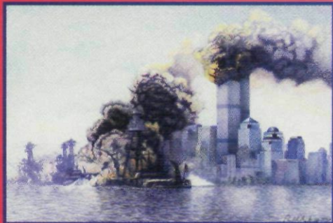
"Awakened With A Terrible Resolve"

An Historical Analogy: 12-7-41 to 9-11-01